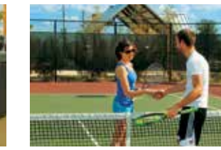
ARBOR SPORTS PARK