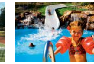
ADVENTURE ISLAND WATER PARK