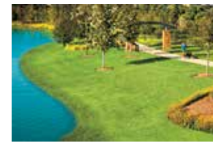
HIKE & BIKE TRAILS