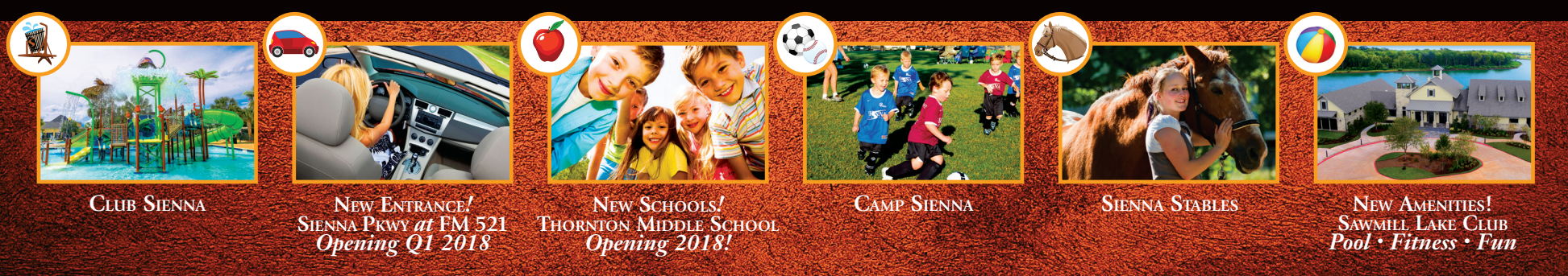
CLUB SIENNA NEW ENTRANCE! SIENNA PKWY at FM 521 Opening Q1 2018 NEW SCHOOLS! THORNTON MIDDLE SCHOOL Opening 2018! CAMP SIENNA SIENNA STABLES NEW AMENITIES! SAWMILL LAKE CLUB Pool • Fitness • Fun